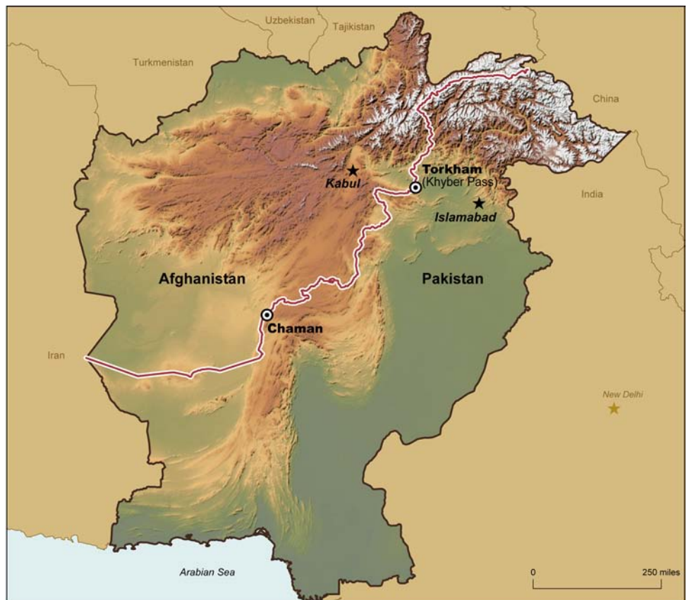
Figure 2: Map of Pakistan and Afghanistan Showing the Two Primary Border Crossings