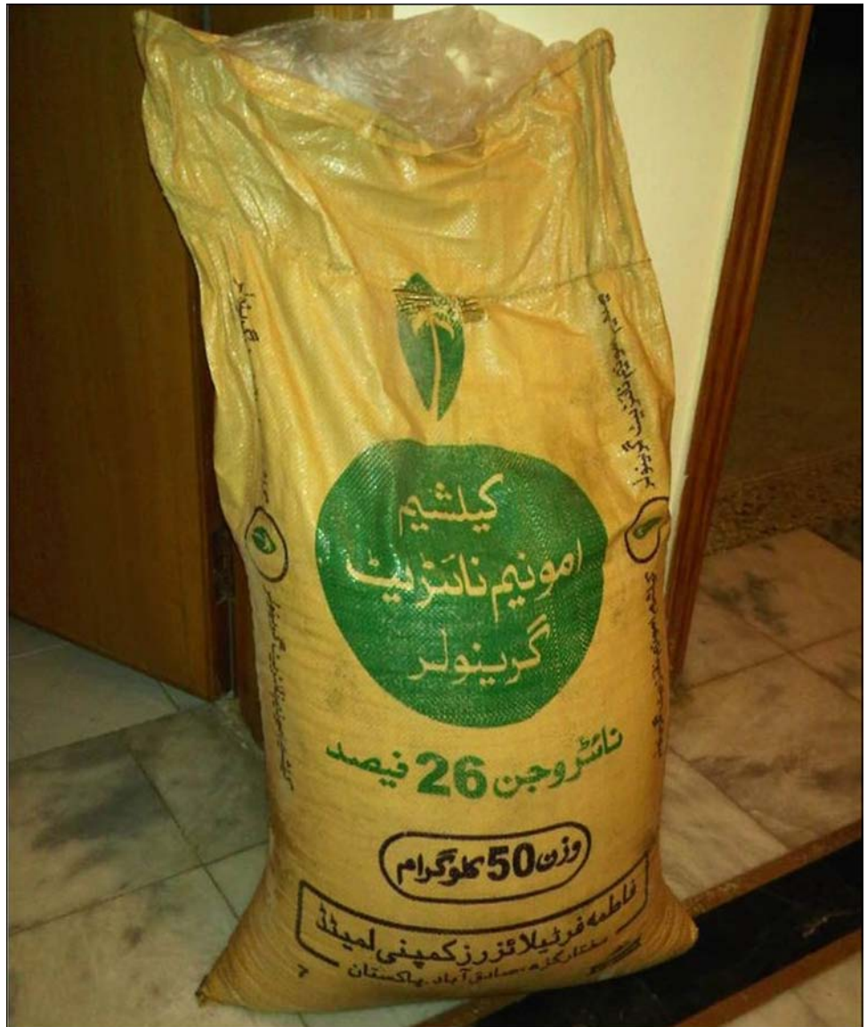
Figure 1: Bag of CAN Fertilizer